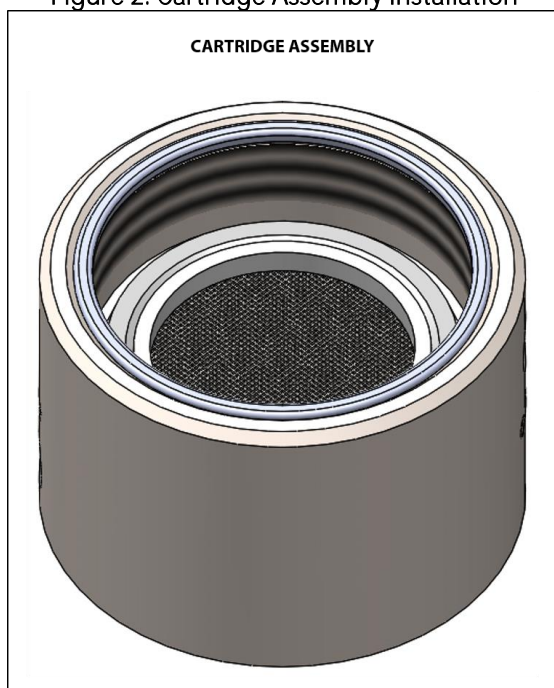
Figure 2: Cartridge Assembly Installation